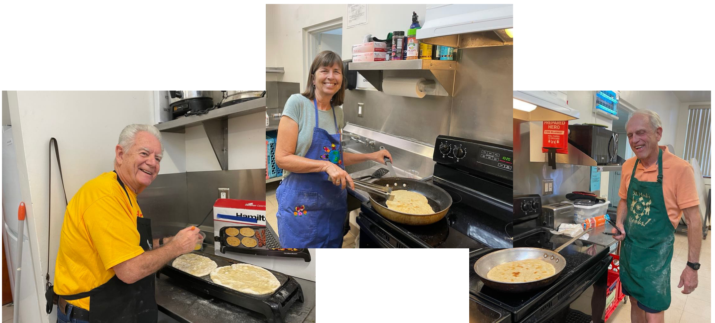
Communion Bread Makers at the May Event

All members of St. Mark's are strongly encouraged to make every effort to attend this meeting.